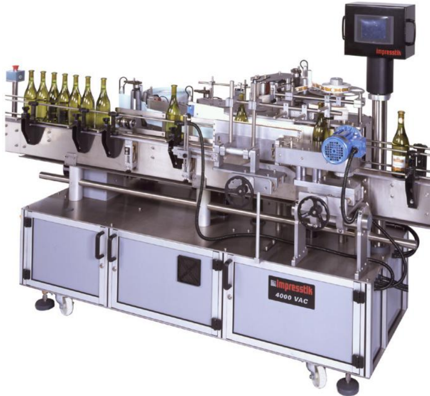
VAC MODULAR FULLY AUTOMATIC P.S. LABELER Suitable for cylindrical product labeling. No change-parts needed.